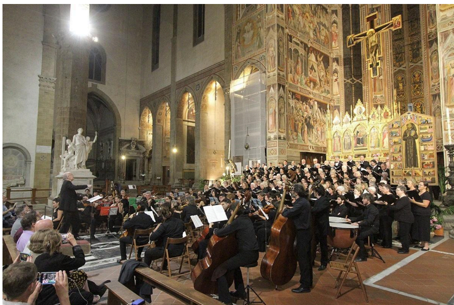
John Rutter conducts his Requiem in front of the altar at Basilica di Santa Croce in Florence