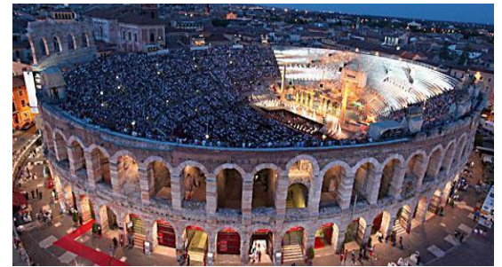
Arena di Verona

Refined, relaxed and romantic, Verona is northeast Italy's second most alluring historic city after Venice. It is also one of the country's most prosperous cities thanks to its position along trade routes to the north, south, east, and west. In the past it was a thriving Roman colony for the same reason, and later became a prominent city-state under the rule of the Scaligeri, its medieval overlords. Rule by Milan's Visconti and