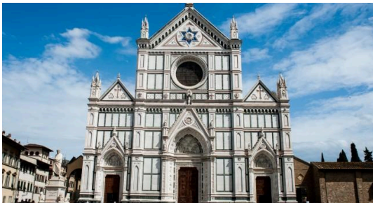
Basilica di Santa Croce

Choral Registration Deadline: November 15 - December 1, 2024 Early Registration Deadline for Complimentary Packages: July 1, 2024 Thirty early registrations gains the visiting chorus one additional land-residency package.