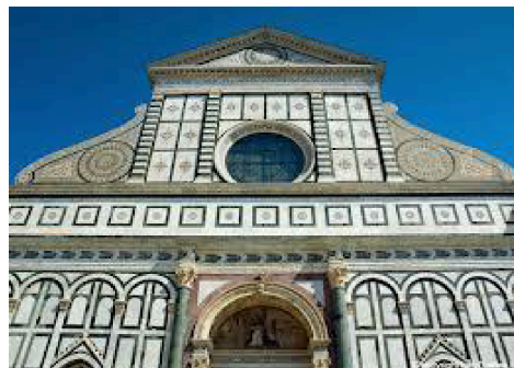
Santa Maria Novella Church

The tour finishes at Piazza del Duomo, by the great Cathedral.