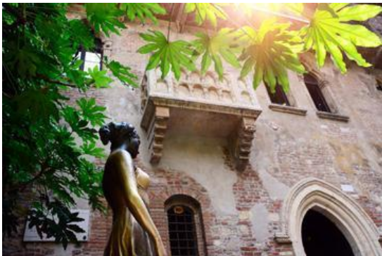
Casa di Giulietta

the Venetian Republic followed, with Venice retaining control until the arrival of Napoleon. From then on, Verona remained under the yoke of Austrian rule until Italian unification.